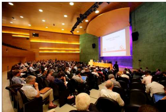
Figure 1: Plenary session

As the conference was being hosted by BSC, the organizational team proposed holding the conference at the AXA Convention Centre in Barcelona (see Figure 1), as it has excellent facilities, and also great connections for both local and international travel.