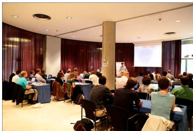
Figure 4: Training session

The slides from the talks in these training sessions are available online at www.eudat.eu and the following sections give a brief summary of each of the talks presented in the different tracks.