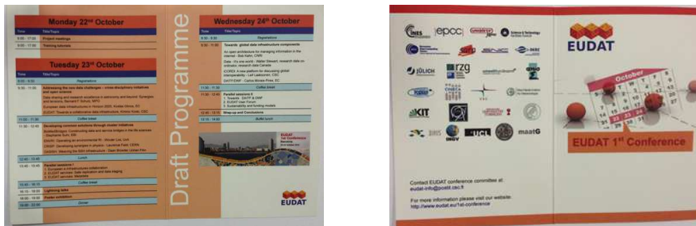
Figure 2: Conference flyer

We decided that it would be helpful for conference attendees to have a handy reference document that they could use during the conference. To that end, we put together a comprehensive conference booklet that included: